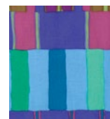
Backing 44" (111.76cm)